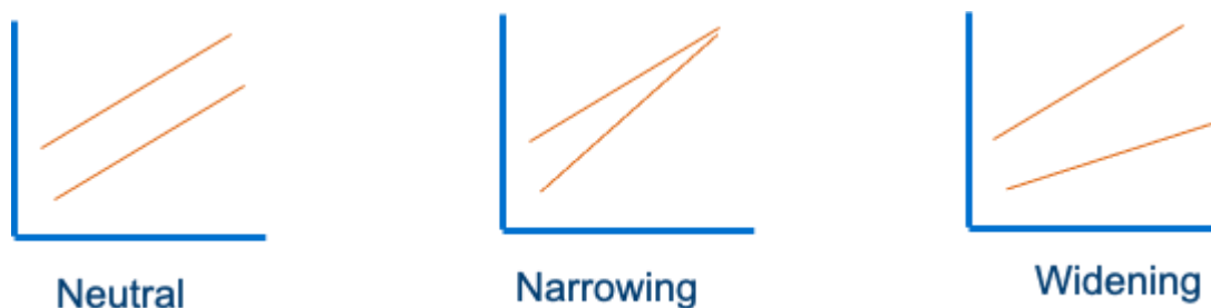
Figure: Potential effects of QI approaches on inequalities

Equity, the absence of inequalities in access, outcomes or experience, is included in many definitions of quality, such as the Institute of Medicine, but is often the most overlooked aspect of quality compared to safety, effectiveness and efficiency. QI projects are likely to have a variety of impacts on health inequalities; some do not affect inequalities, with others may inadvertently narrowing or widening them.